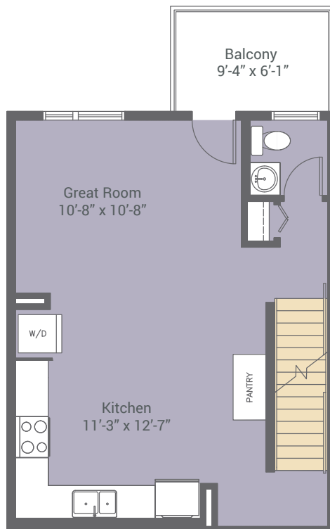
Main Floor 514 Sq.Ft.